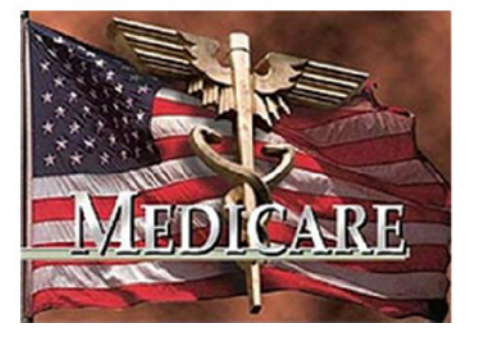
FIGURE 7. The greatest social change in medicine during my father's career was the passage of Medicare in 1965.