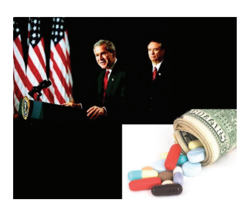
FIGURE 9. Knowing Medicare was hemorrhaging, George W. Bush and Congress passed the Medicare Drug Act.

I support the requirement of disclosure of true conflicts of interest by speakers at continuing medical education