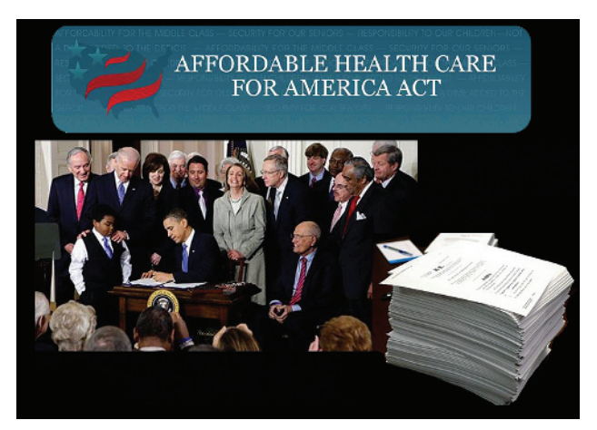
FIGURE 10. President Obama signing the Affordable Care Act of 2010.

Has professionalism in medicine been tarnished by the criticism of self-appointed critics and by bureaucratic