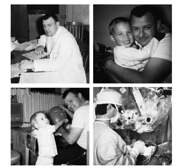
FIGURE 2. I am a physician because my father is a physician. Top left, my father during his residency. Top right and bottom left, my father with me as a child. Bottom right, a photo of me as a physician.

Remember that definition of profession? The assumption of expertise. Throughout most of my father's career, this was a ubiquitous assumption. Generations of physicians like